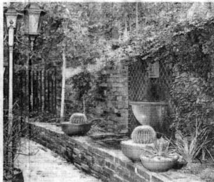
There are five water features on the property, and at this feature, the back wall nestles against Camelback Mountain.

“The typical approach in the Valley is to perch houses